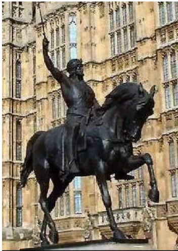
Statue of Richard the Lionheart in front of the Palace of Westminster (Parliament), London, England

earned that name because of his reputation as a great military leader and warrior. He remains an enduring, exemplary individual in both England and France as he beautifully exemplified the ideals of his age.