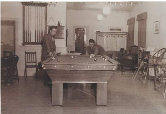
Recreation Room at the Bethpage Lodge No. 975 Masonic Service Center in Farmingdale.

Masonic community activities during World War II included the creation of a national network of U.S.O.-like service clubs by state grand lodges and the Masonic Service Association. During World War II, 90 Masonic Service Centers were formed to service the military throughout the U.S. In the State of New York, eleven Masonic Service Centers were active during the war, each supplying a place that provided meals, recreation, transportation, letter-writing material, and free long-distance phone calls for the servicemen.