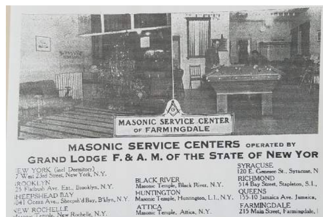
Rare postcard of the Masonic Service Center of Farmingdale

The second Service Center on Long Island was only eleven miles away in Huntington Village, where Jephtha No. 494 entertained 6,447 servicemen.