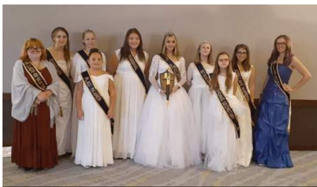
Truth Triangle #31 chapter at the 2021 Biennial Convention

During October 8 th through 11 th , Truth Triangle #31 attended the 31 st Biennial Convention of the Organization of Triangles, Inc. This year's convention, "Triangle Through Time," emphasized exploring ancient civilizations, and was held at the Albany Hilton, just across the street from the Albany Masonic Temple. Our chapter had nine members and several Supervisors in attendance, despite the challenges presented by very stringent COVID protocols.