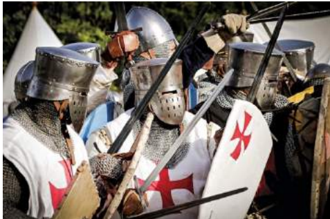
A modern reenactment of Templar Knights in full battle armor. Photograph by DEA/C. Balossini/De Agostini/Getty Images (Photo left)

Of seven major Crusades launched to free the Holy Land from Muslim rule, only the First Crusade achieved tangible gains—taking Jerusalem in 1099 and massacring most of the Jewish and Muslim inhabitants who tried to defend the city. The crusader movement inspired the foundation of several military-religious orders devoted to holding and defending the Holy Land—the most famous of which were the Knights Templar.