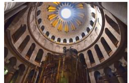
The Rotunda of the Church of the Holy Sepulcher in Jerusalem is traditionally identified as the location of Jesus' tomb. (Photo above right)

The first priority for the crusaders was to rebuild the Church of the Holy Sepulcher. The new design restored the idea of combining two separate buildings—a basilica commemorating Golgotha, and a rotunda surrounding Christ's tomb—into one structure, though two domes still mark these spaces from the outside. Also, a bell tower was added. Allowing for various additions and restorations, this is the church that visitors to Jerusalem's Old City see today.