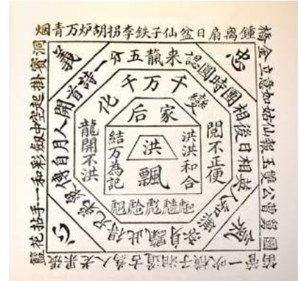
A Chinese Hongmen seal from the 19 th century. Image courtesy of Chinese Research by Alexander Wylie, Shanghai, 1897